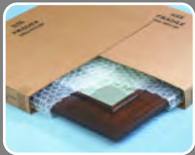
Telescoping mirror carton